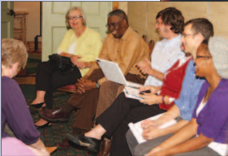
Participants begin planning a statewide network

tant areas as access to justice, equity in education, access to health care, and youth programs.