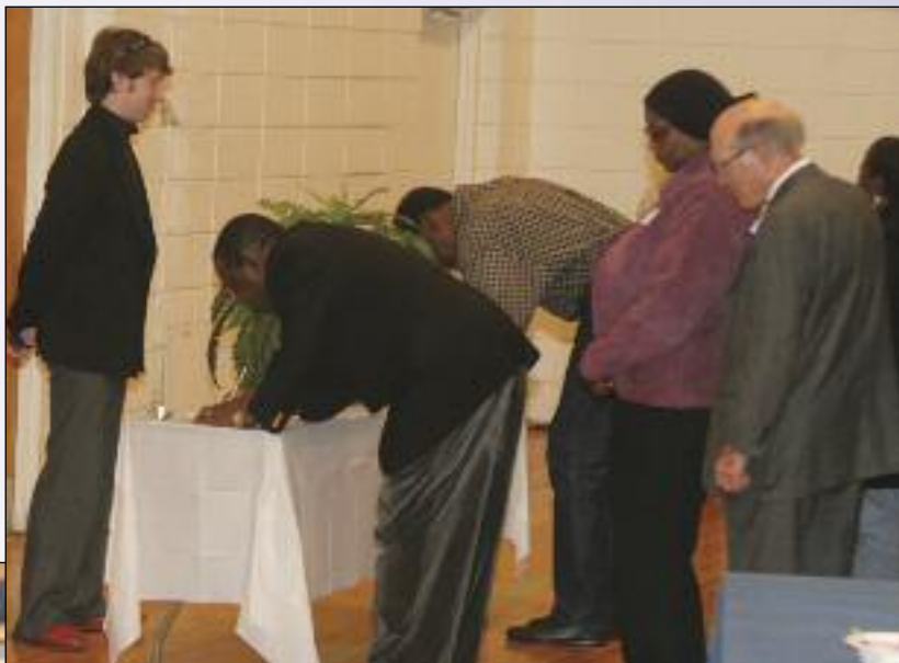
During a public ceremony held in Jackson, 130 people from around the state gathered to sign the Declaration of Intent for the Truth Project, which sets forth the nature of crimes to be examined by the Truth Commission.

Members of the steering committee will work to