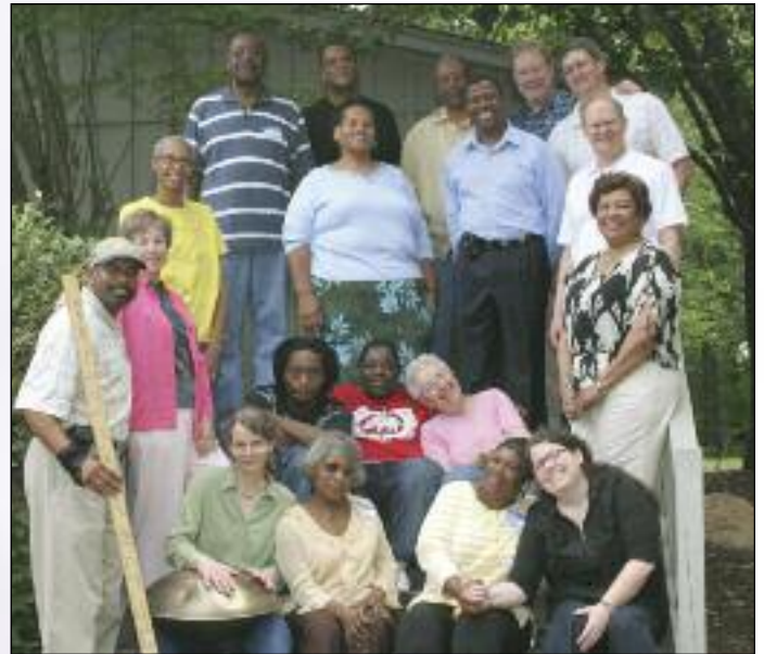
Greenwood citizens participate in a Welcome Table training session where they learned to listen to and trust each other. The retreat was held May 8-9 at Lake Tiak-O'khata.

The pilot period encompassed two retreats, one in November 2008, for statewide leaders, and a second one