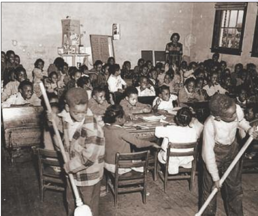
Historic photograph of the Drew Rosenwald school