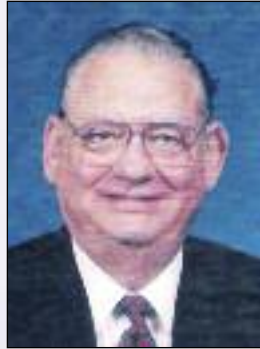
Judge Gray Evans

The time has come when both blacks and whites must be able to shed their resentments and finally bury Jim Crow. We must work toward a future of living together in peace and harmony, no matter the color of our skin and the backgrounds of our ancestors. I am hopeful that someday soon we will all look at each other as just people, American citizens with equal rights and privileges under the laws of this wonderful land in we are all privileged to live.