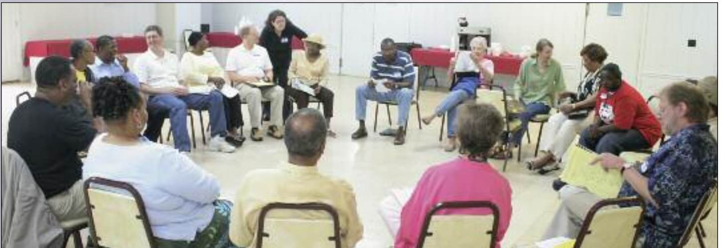
Greenwood citizens gather in a story circle at Lake Tiak-O'khata.